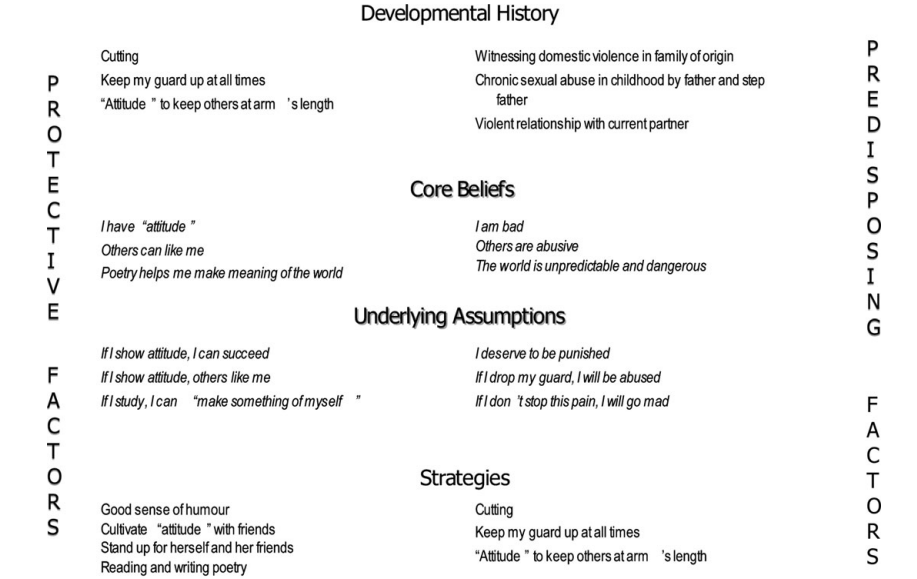
Figure 3. Conceptualization of Beth's vulnerability and resilience to inform treatment plan

are more likely to provide checks and balances to therapist reasoning errors, feel ownership of the emerging conceptualization, and perceive a compelling rationale for treatment.